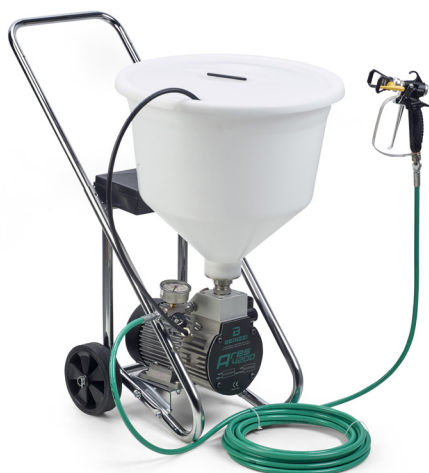
Electric Diaphragm Pumps