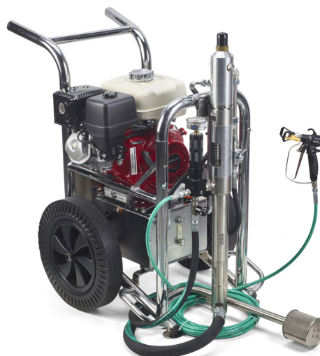
Hydraulic Piston Pumps