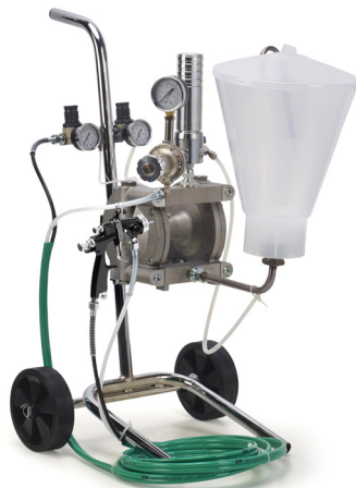
Pneumatic Double Diaphragm Pumps