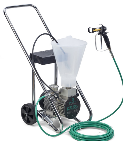
Electric Diaphragm Pumps