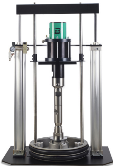
Pneumatic Extrusion Pumps