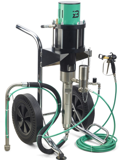
Piston Pneumatic Pumps: APOLLO 303, APOLLO 30, APOLLO 48